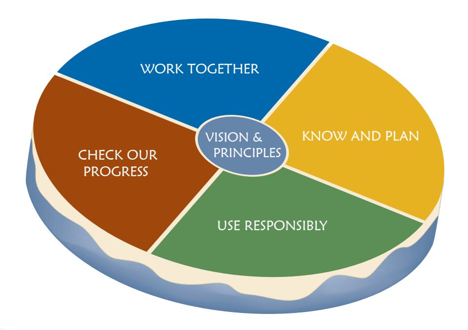
Figure 4: Components of the Strategy

Each year water partners need to collectively set priorities and find ways to realize these actions. In some cases, initiatives undertaken through broad environmental stewardship actions, such as the NWT Environmental Stewardship Framework, may also advance the Strategy's vision and goals (see Appendix H – NWT Environmental Stewardship Framework).