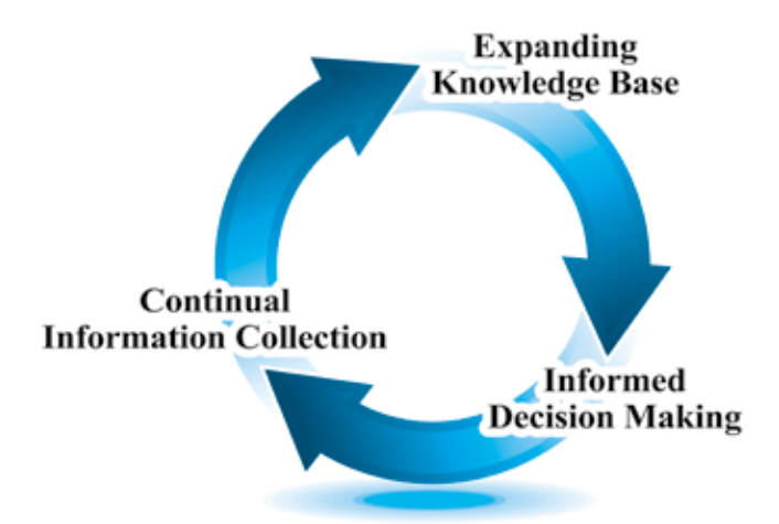
Figure 3: Information to Understanding to Decision Making

If we use adaptive management, we can improve how we manage risk to the environment and human health. Ongoing monitoring can confirm whether actions taken to prevent or reduce negative impacts on the environment are working. For example, a robust monitoring program at an industrial or municipal development could detect change in water quality and point to changes needed in water treatment processes or other measures before environmental harm is irreversible or too significant.