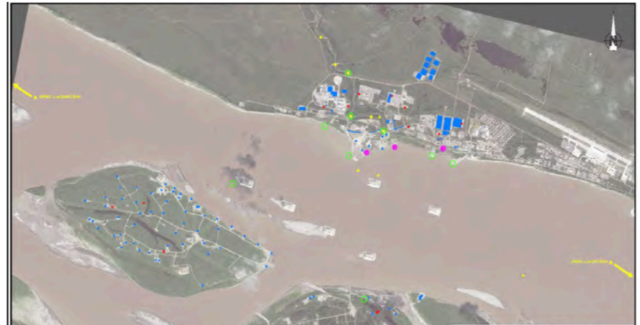
Norman Wells Operations

Image Source: SLWB Public Registry/Imperial